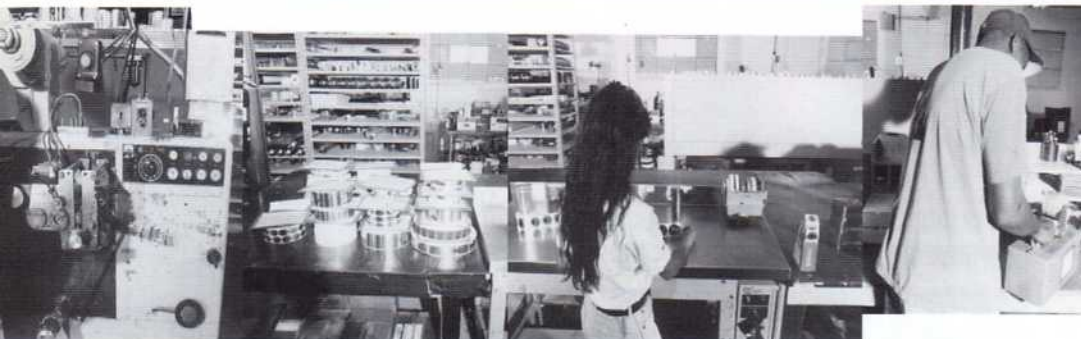
(4) Space for printed labels