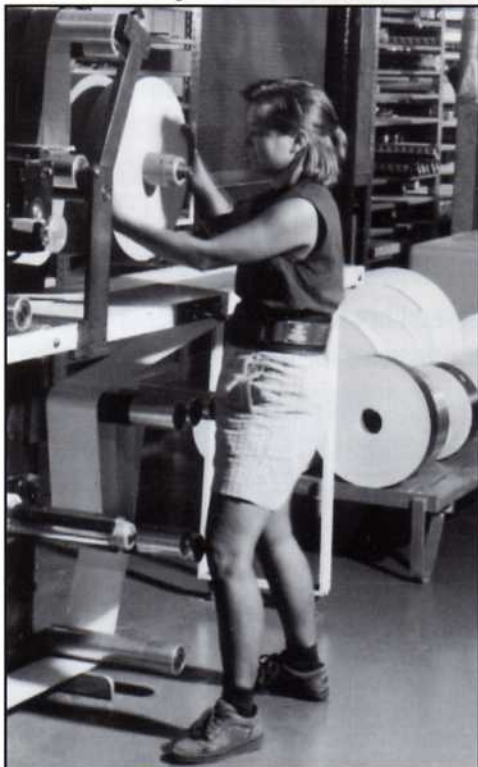
View from shipping